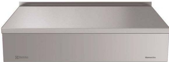
589171 (MCNABBKOOO) Closed Work Top, one-side operated with backsplash